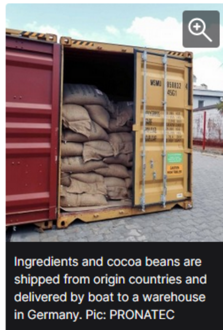
Ingredients and cocoa beans are shipped from origin countries and delivered by boat to a warehouse in Germany.

With Swiss efficiency combined with fine Dominican Republic organic cocoa beans, you get the sense that PRONATEC is ideally placed to absorb any new legislation, cope with demand and ride out the continuing global storm pressures of inflation and price hikes caused by the political and economic upheavals affecting the commodity and energy markets.