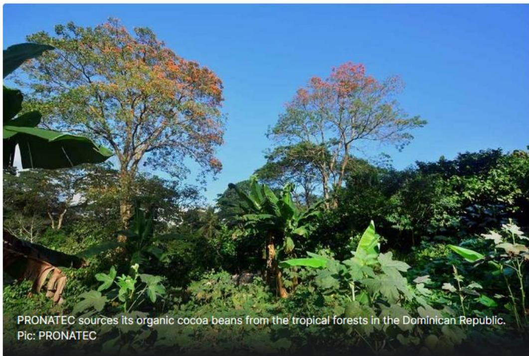
PRONATEC sources its organic cocoa beans from the tropical forests in the Dominican Republic.

RELATED TAGS PRONATEC Cocoa Dominican Republic Sustainability